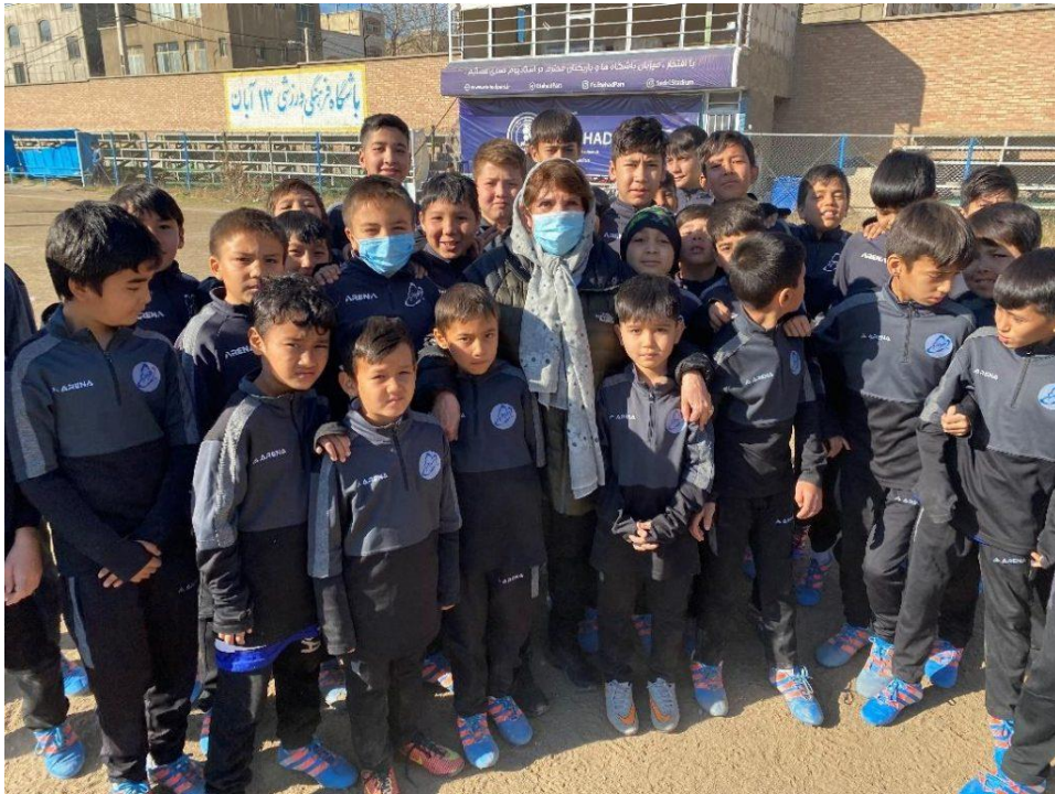
PKCF's CEO visiting the Popli Football Club February 2022

110 Afghan refugee boys (aged 7-15) attend twice a week during term time and six days a week during the summer holidays. In addition to integrating with Iranian boys and playing football, the boys learn transferable skills such as discipline and teamwork.