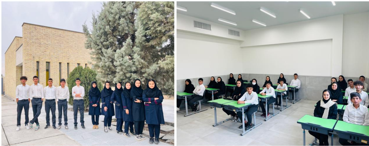
Group of students in the School yard and the classroom, Forough Mehr Middle School, Jaffarabad, Ghazvin, 2023

Fifty-five girls and boys attend the middle school, and another 56 girls will eventually enrol in afternoon secondary school classes.