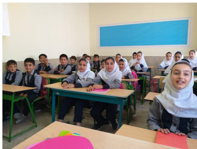
Students in the classroom, Primary School, Jaffarabad, Ghazvin 2023