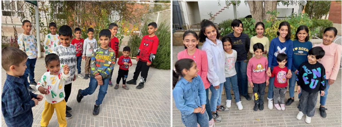
Bachehay Ma Orphanage, younger boys and girls, Kerman, Autumn 2023